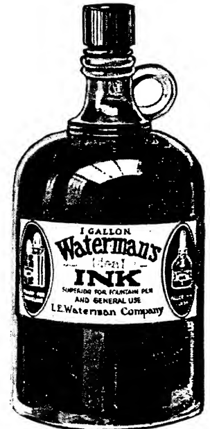
Gallon with Pour-Out. Packed Individually. Shipping Wt. 15 lbs.

Business Offices, Schools, Institutions and other large users of ink will find it decidedly economical and most convenient to buy their Waterman's Ink in large containers and refill small individual bottles as needed.